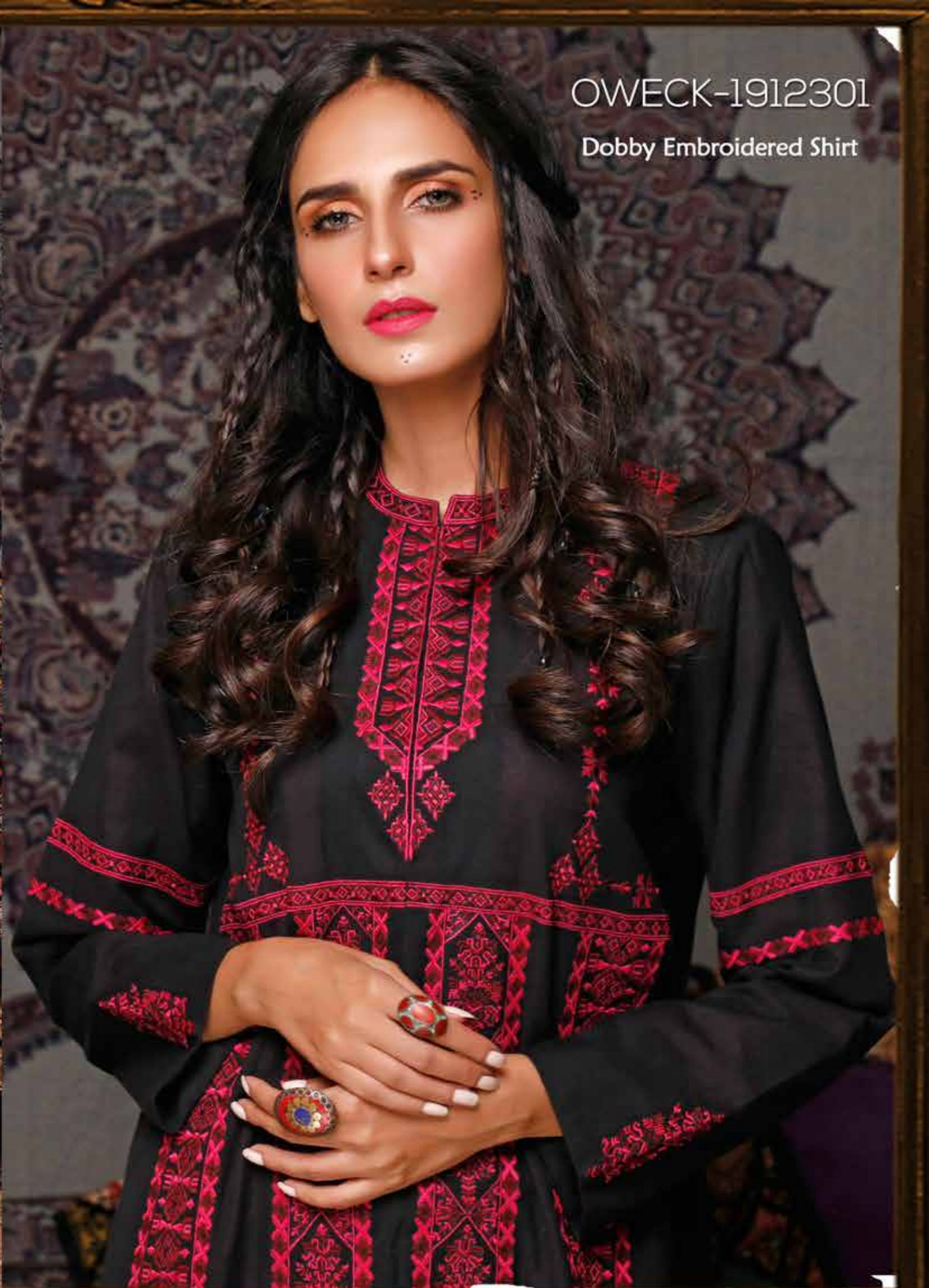
OWECK-1912301 Dobby Embroidered Shirt